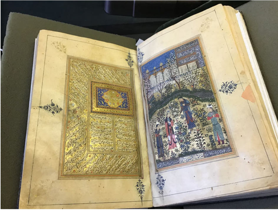
Figure 5. “Humay and Humayun in a garden” and the beginning of Sa’di’s qasidas , early twentieth century. Source: Free Library of Philadelphia, Rare Book Department, Lewis O.68, folios 185b–186a.