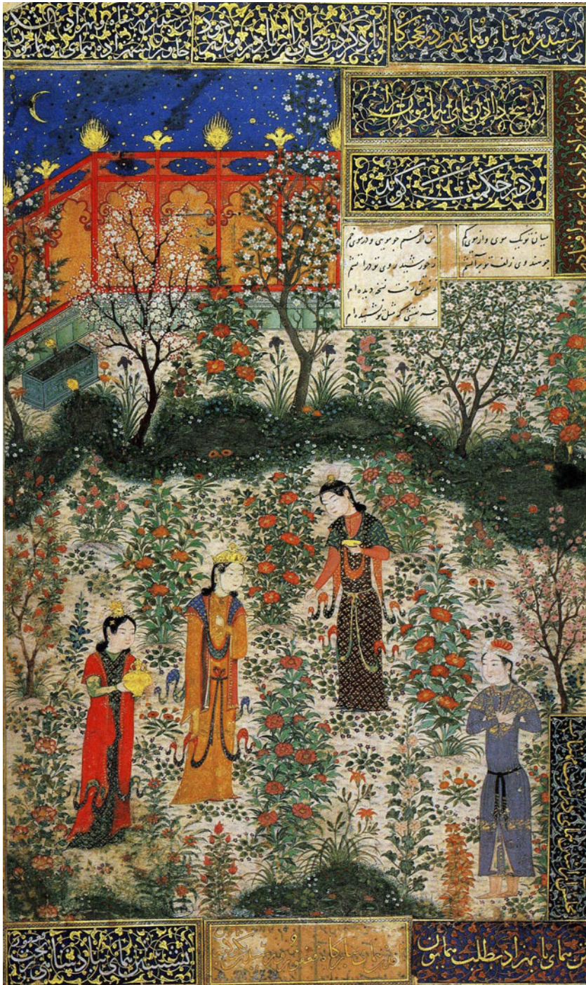
Figure 1. “Humay and Humayun in a garden”, Iran, circa 1430. Source: Musée du Louvre, Paris (deposited from Musée des Arts Décoratifs, n°AD 3727). © Musée du Louvre, dist. RMN—Grand Palais/Raphaël Chipault.