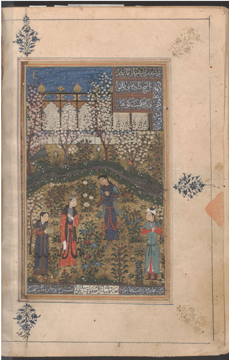
Figure 2. “Humay and Humayun in a garden”, early twentieth century.