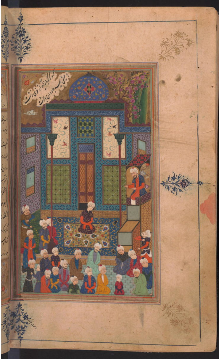
Figure 4. “Mosque scene”, early twentieth century.

of the Philadelphia scene, have been pared down, with two eliminated from the top centre and top left and the vertical one from the lower right side.