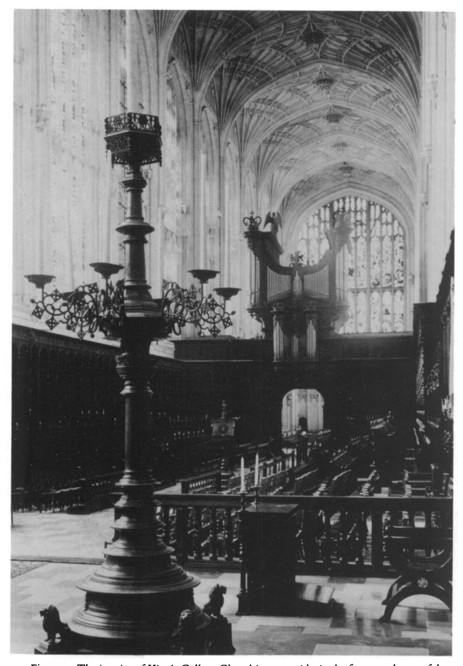
Fig. 1. The interior of King's College Chapel in 1951 with, in the foreground, one of the pair of brass candle-standards designed by George Gilbert Scott jun.