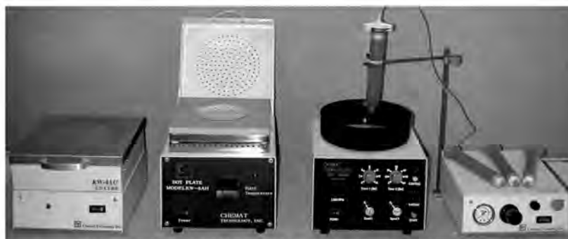
UV Curer KW-4AC