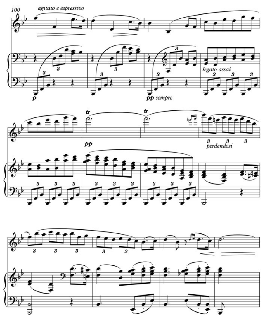
Ex. 4 Joachim, Romance Op. 2 (bars 100–114)

Stephen Rodgers has observed, 'French strophic song form with verse and refrain [was] often referred to ... by one of two names: romance and couplets '.<sup>65</sup> We could redefine couplets as strophic form or sometimes as verse–refrain form. Viewed as strophic form, our understanding of this romance does not quite account for the 'C' part but A and B, and A' and B" could potentially be viewed as two verses, followed by an abridged last glimpse of A". The repetitive (rotational) nature of the romance could well fit the pastoral interpretation of its ending: the repetitive triplet-motive could serve as a metaphor for the three rotations of the romance. Thus, Joachim's Op. 2, even if featuring an expanded possibly