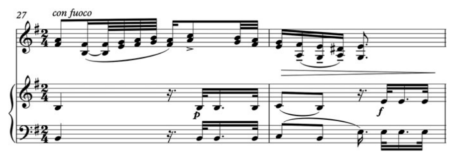
Ex. 8 Joachim, Romance in G major (bars 27-28)

Joachim's middle section in E minor was misunderstood by some reviewers. One found it not to be 'significant enough at all': 'the middle section in e minor pleases us less than the opening theme. The melodies in it are not on a par with those of the main theme, and are not significant enough at all'. But they are energetic, similar to Berlioz's 'refrain', and could be viewed as a 'refrain' in Joachim's G major Romance, given its many returns throughout the movement, often in fragments, and yet unmistakably recognizable due to its head-motive (Ex. 8).