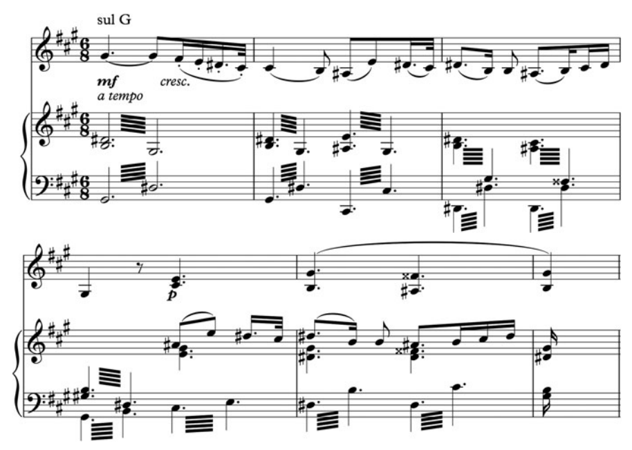
Ex. 6 Berlioz, Romance Op. 8

his L'Art du violon that the art of performing a 'simple song' ('chant simple') like an air or the romance relies not on outward activity or manner, but rather in a way of being immersed in the spirit of a composition: