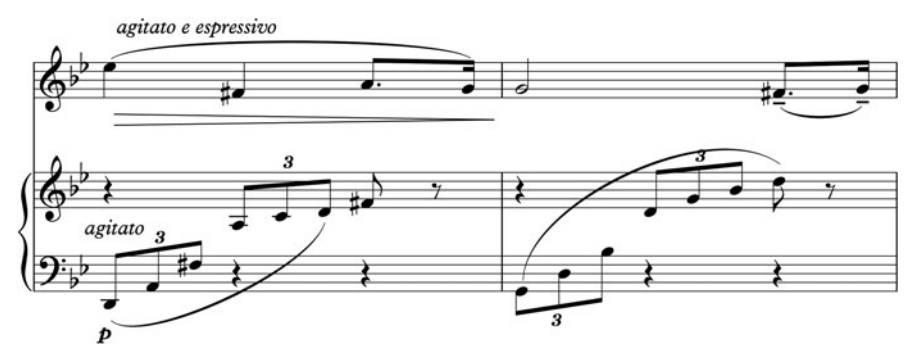
Ex. 2 Joachim, Romance Op. 2 (bar 36)