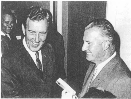
Sen. Muskie and Gov. Agnew cross paths