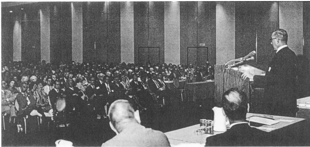
Fainsod addresses Plenary Session