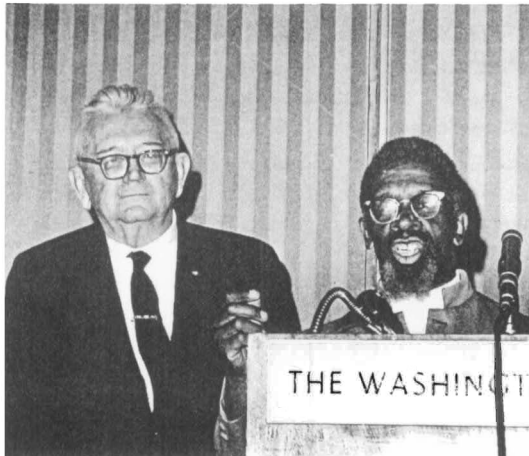
Gen. Lewis Hershey and questioner