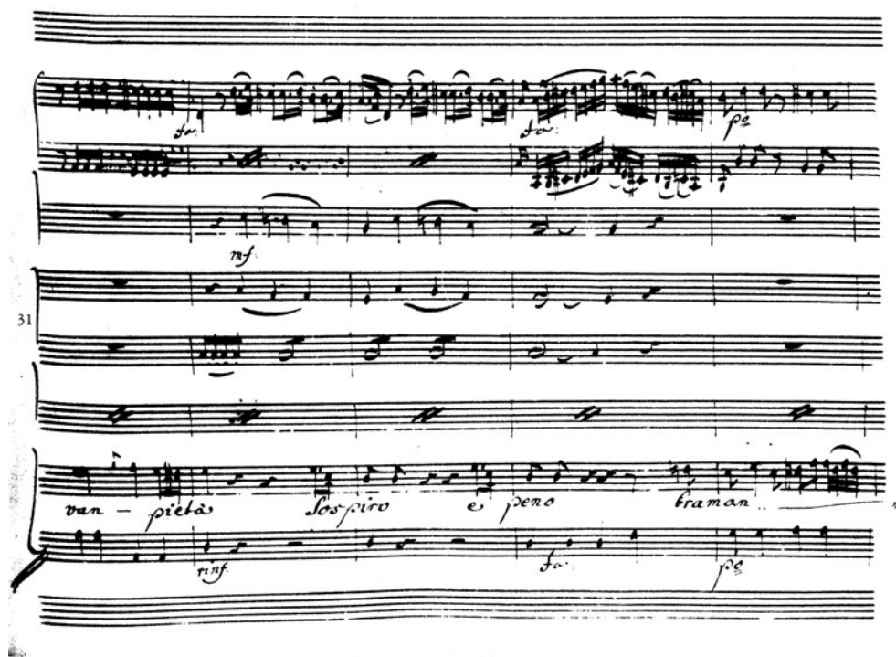
Example 1. Johann Christian Bach's aria 'Anch'io per un'ingrata' from Lucio Silla (W.G.9, Act I no. 8, bb. 31–5, 1774).

he had Don Giovanni's onstage wind band play a well-known tune from Martín y Soler's Una cosa rara (1786), an opera in which paired clarinets give a special colour to three amorous scenes: the cavatinas of Lilla ('Ah pietà de mercè', scene 4) and the Principe ('Più bianca di giglio', scene 5), and Lilla's aria 'Dolce mi parve un dì' (scene 14).