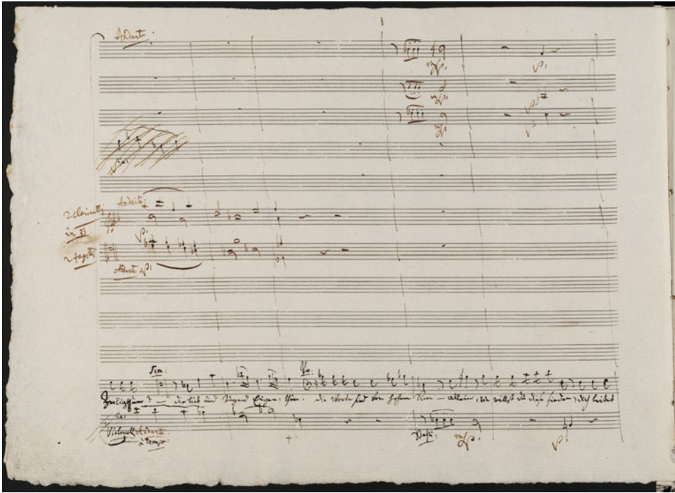
Figure 1. The manuscript of Mozart's Die Zauberflöte , Act I no. 8, bb. 88–92. Courtesy Staatsbibliothek zu Berlin (D-B): Mus.ms.autogr. Mozart, W.A. 620.

kill Tito, his friend and sovereign, to satisfy Vitellia's jealous demands. What is the clarinet doing here? I would suggest that it evokes the inner dialogue that speaks behind and through Sesto's desperate assertions, as if the clarinet were a kind of inner confidant, even a voice of conscience, which does not double Sesto's line (as if to indicate acquiescence) but comments in a more complex way. Indeed, we have known from the opening recitative of Act I that Sesto's inner state is deeply conflicted.