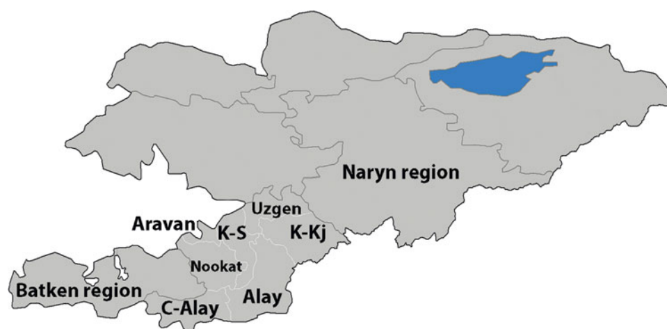
Figure 1. Map of the regions (oblast') and districts (raion) of the Osh region of Kyrgyzstan covered in the study. C-Alay, Chon-Alay; K-Kj, Kara-Kulja; K-S, Kara-Suu.

There was no difference in CE prevalence relative to gender (odds ratio [OR] = 1.13 for men). The age distribution of CE prevalence was relatively even (Table 1), with somewhat higher prevalence at an age over 60 (OR = 1.33, P < 0.05 vs other age groups combined). This profile was compatible with the recent emergence of the epidemic, because elderly subjects did not accumulate exposure over their whole lives proportional to their age. Expectedly, the fraction of post-resection cases was somewhat lower among younger patients, 57% of the total prevalence in