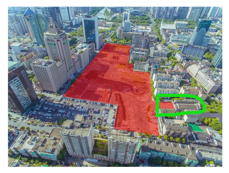
Figure 2. Image shared in Midtown WeChat groups in May 2018. The area circled in green is Midtown Catholic Church, including the parcel of land in contention.

structure, proffers its own representation of personhood and, by extension, concept of agency and mode of participatory access (Agha 2007b, 321; Morson 2010, 93). Many parishioners critically compared Midtown's middle-aged (but fresh-faced) priests, none of whom was from Hangzhou, to the pious local elderly. (Father Huang was from Zhejiang, but he hailed from a county much closer to the Anhui border than to Hangzhou.)