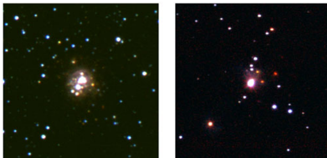
Figure 1. LIRIS/WHT infrared JHK S images, sized 1' × 1', of two A-SMASHeR targets: a compact cluster ( left ) and a relatively isolated central star surrounded by sparsely distributed faint objects ( right ).