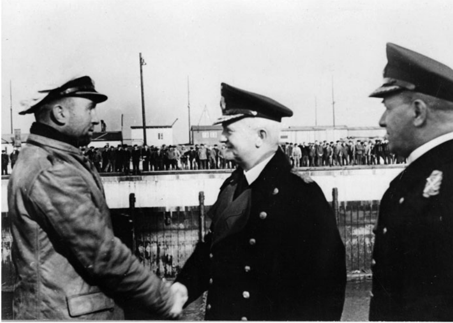
Figure 3. Kapitänleutnant Günther Prien being greeted by Vice Admiral Dönitz after sinking HMS Royal Oak on 14 October 1939 at her moorings in Scapa Flow

long. Ambiguity surrounded ‘definite instructions’ as submarine commanders tried to obtain ‘clarification of orders and, at the same time, a lifting of the seemingly impossible limitations’ (Mallmann Showell 1989, 11). Armed merchantmen were considered de facto naval auxiliaries, deemed outside the prize laws, and as such could be sunk without warning. Whilst prize laws were German official policy, the Navy’s U-boat arm had never fully supported them and, ‘step by step’ found them increasingly impossible to observe ‘in response to breaches ... by the enemy’ (Levie 1998, 317). In this war of attrition, Dönitz considered every enemy ship a legitimate target (Dönitz 1947).