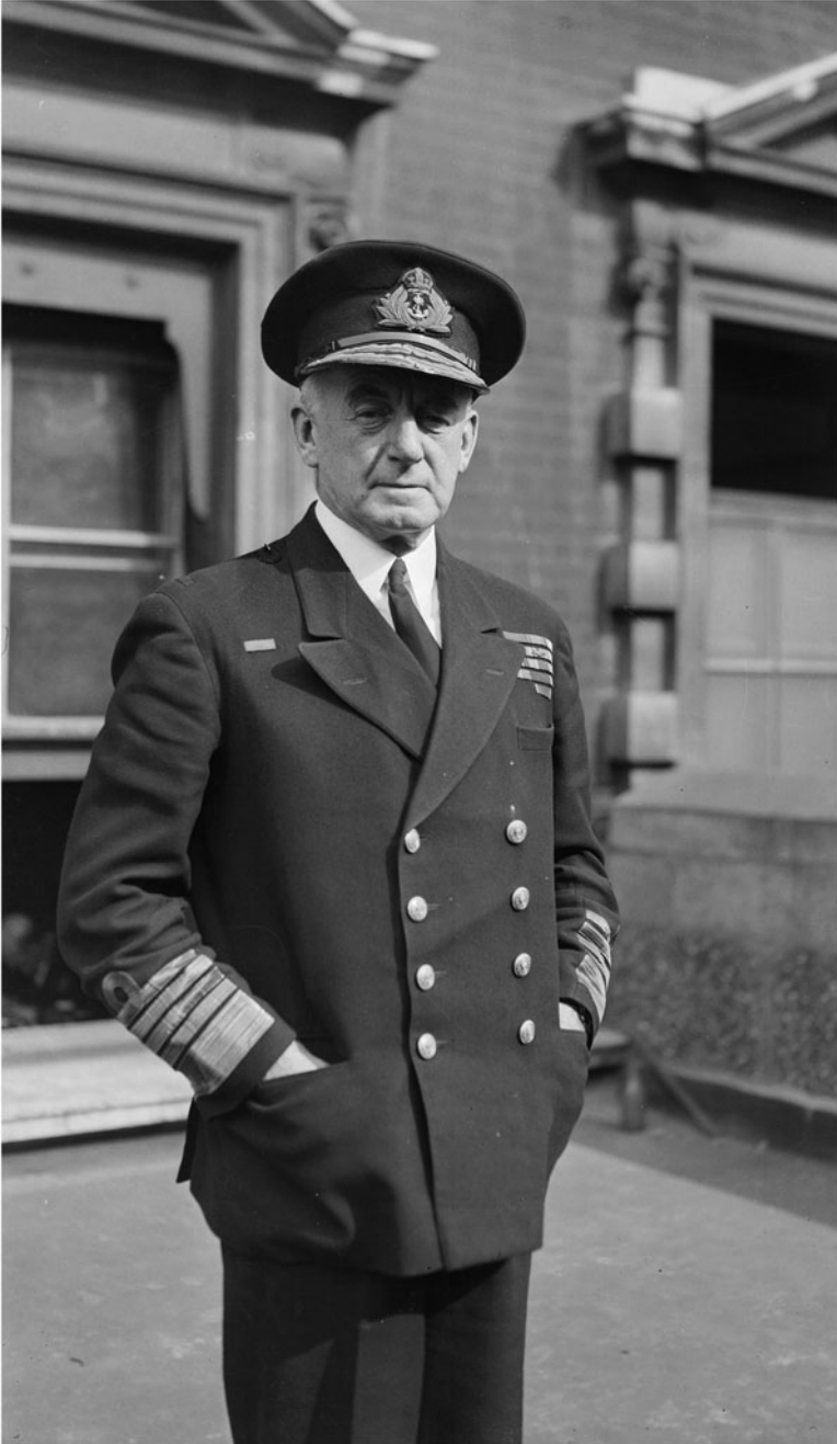
Figure 2. Admiral of the Fleet Sir Dudley Pound, who acted as chairman of the British Chiefs of Staff Committee 1939–1942

to engage the Italians and also prevent defeated French ships falling into Axis hands, unavoidably taking further badly needed ships, aircraft and resources away from home waters and the battle in the Atlantic (Mawdsley 2020, 111–115).