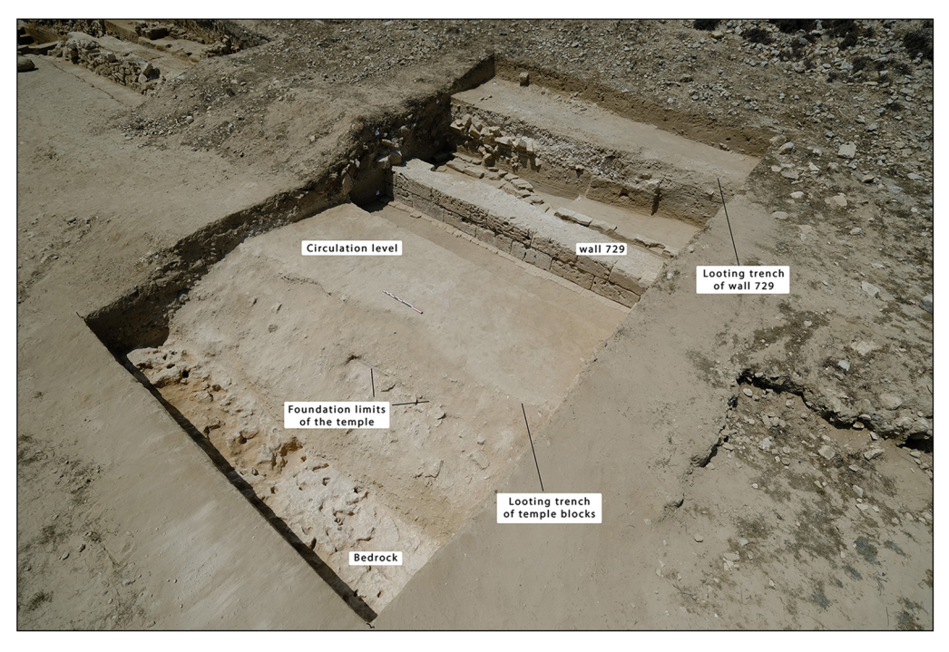
Figure 3. The retaining wall and plunder trenches, viewed from the north-east (figure by S. Dhennin).

remaining traces of New Kingdom stone monuments: a fragment of a stele with the cartouches of Seti II (Boussac et al. 2016: 21); several blocks from a temple dedicated by Ramses II (Figure 4); and fragments of private chapels from the Ramesside period (1292–1069 BC) (Dhennin & Somaglino 2022). Since 2022, the discovery of well-preserved levels and structures is bringing new dimensions to this New Kingdom settlement.