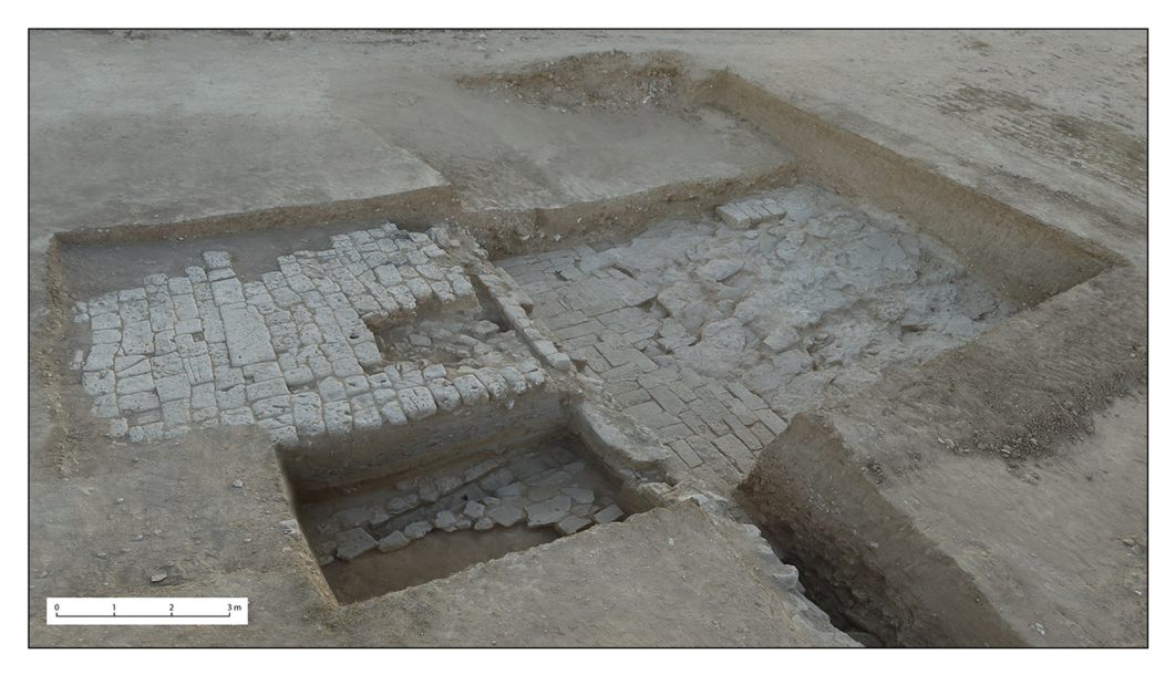
Figure 2. The temple area, viewed from the south-east (figure by G. Pollin © Institut Français d'Archéologie Orientale).

A few items unearthed during surveys or excavations on the Hellenistic levels of the kom indicate the presence of an earlier New Kingdom settlement, probably related to wine production. This settlement was likely founded during the Eighteenth Dynasty (c. 1550–1292 BC), as shown by an amphora stamp bearing the name Merytaton—the daughter of Akhenaton and Nefertiti (Boussac et al. 2016: 19–20). Several reused elements are the only