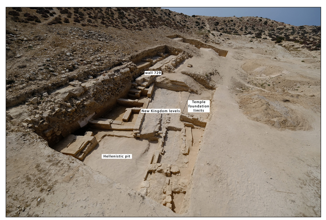
Figure 5. General view of the New Kingdom settlement, from the south-east (figure by S. Dhennin).