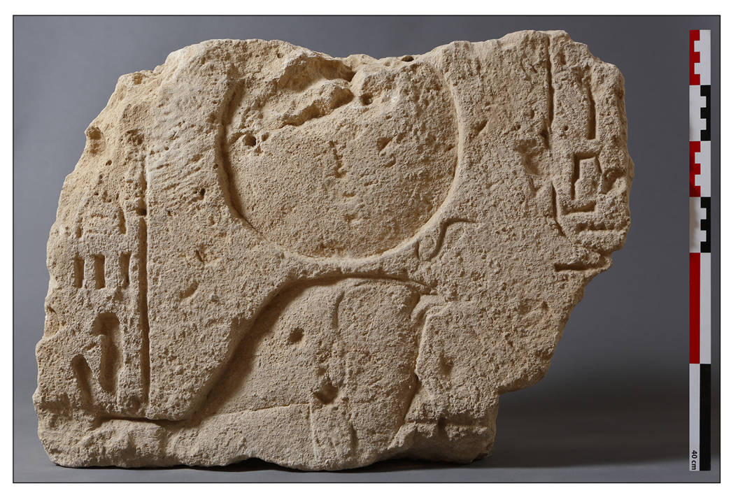
Figure 4. Block depicting Ra-Horakhty from the temple of Ramses II (figure by G. Pollin © Institut Français d'Archéologie Orientale).