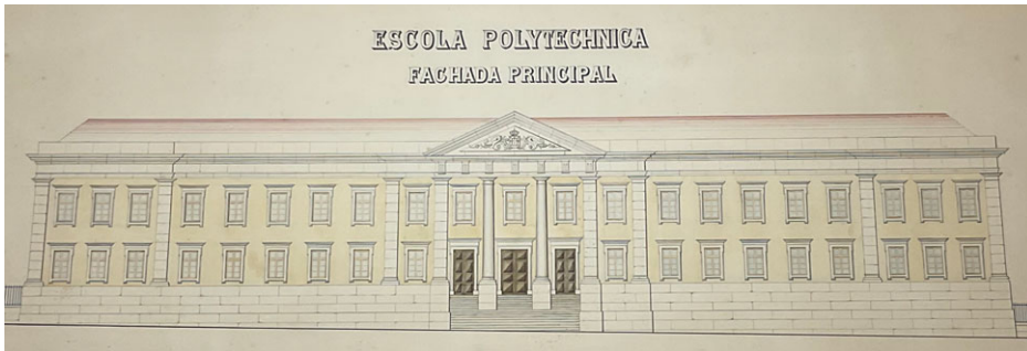
Figure 2. Main façade of the new building of the Lisbon Polytechnic School, c. 1863 (LPS main façade 1:100, UL217, Drawing Collection, AHMUL-EPL). The reconstruction following the 1843 fire introduced changes to the original building (compare with figure 1 ). The most evident modification was the conversion of the former church into the School's main hall. The architectural consistency of the whole was given by the roof, which established continuity between the School's different wings. These were complemented with other neoclassic elements: a pediment, supported by two strong columns, and a stone staircase leading to the main entrance.