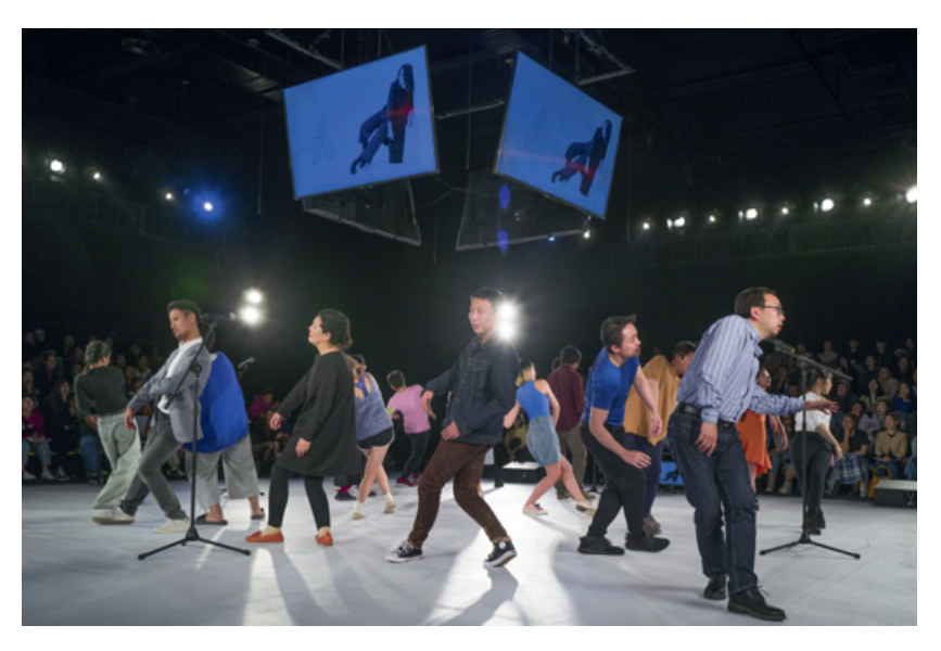
Figure 7 A Brief History of Human Evolution (2019), directed by Li Jianjun.

The performances at the 2019 Wuzhen Theatre Festival took place in an arena equipped with computers and large overhead screens facing the audience seated on four sides. The actors opened image files stored on the computers, which were projected onto the screens. This setup created a 360-degree media panopticon, reflecting the ubiquity of displays and imaging devices in contemporary society. They then engaged in 'imitation performances' ( mofang biaoyan ) of over one hundred images displayed sequentially on the screens, first individually, then in quartets, and finally as a full ensemble, implementing a performance method that Li Jianjun has described as 'image karaoke' ( tuxiang kalaOK ) or 'choreography with images' ( yong yingxiang bianwu ) (Li H., 2019) (Figure 7). The images used in the production were selected from a large library of photographs and videos sourced online and contributed by participants in casting workshops held prior to