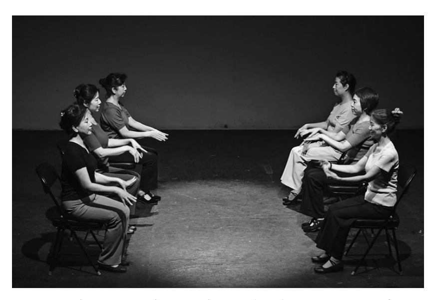
Figure 4 50/60 – Dance Theatre with Dama (2015).

50/60 marks Wang's first foray into a choreography of the real based on the exploration of cultural memory and collective identities mediated by the body. Wang recruited a group of six women in their late fifties and sixties from among the hundreds of guangchang wu enthusiasts who enliven Beijing's squares and parks but are often perceived as a public nuisance. The director-choreographer bonded with the women over an extended period of time through workshops and daily activities, gently guiding them to tap into their natural bodies and find dance in spontaneous everyday actions rather than choreographed performance (Figure 4). The imprint of the quotidian on their stage movements is tangible, revealed in simple gestures such as walking, dressing, combing hair, and doing housework. The softness and natural simplicity of the movement and music contrast sharply with the fast-paced routines and boisterous soundtracks typical of guangchang wu. The women take the stage not as a stereotypical crowd of dancing dama (a common but rather pejorative term for middle-aged and elderly women), but as themselves,