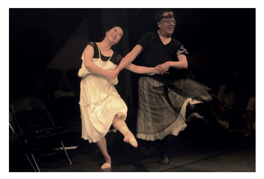
Figure 5 When My Cue Comes, Call Me, and I Will Answer (2019).