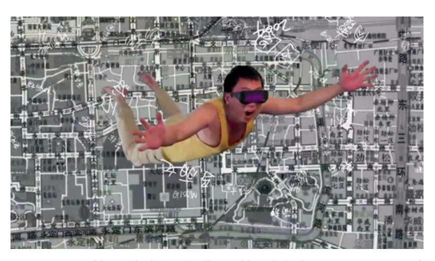
Figure 9 A Welder's Flash (2020), directed by Li Jianjun. Image courtesy of New Youth Group (Screenshot by the author)

Ma's fortunes took a turn for the worse in 2017, when the government launched a campaign to expel migrant workers from the capital, and declined further during the pandemic, as he also testifies in the Popular Mechanics webcast. Nonetheless, the final scene affords a vision of hopeful futurity, as he is seen flying over a digital map of Beijing through immersive VR technology (Figure 9). This virtual simulation represents both an escape fantasy and a liberating projection of the future he imagined when he first arrived in the city. Virtual reality gives him agency in shaping his future trajectory, as opposed to the embodied reality of his present life. The VR scenario thus activates a futural orientation of potentiality , namely 'the future's capacity to become future , or the future as virtuality in the present' (Bryant and Knight, 2019: 107). This future is not yet actual, but real nonetheless, echoing