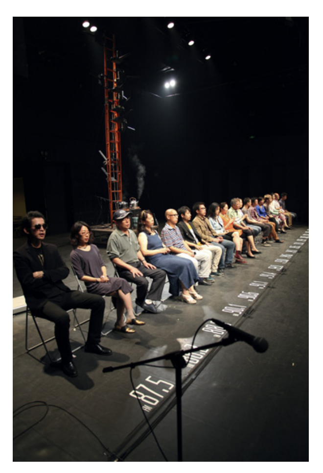
Figure 3 One Fine Day (2013 version), directed by Li Jianjun.

storytellers. Private memories, experiences, and aspirations provide the dramaturgical material, and ordinary people performing real-life stories become the performance text. For the original production of One Fine Day (Meihao de yi tian), premiered in 2013, nineteen participants of different ages, professions, and social identities were recruited in Beijing through casting calls, workshops, and interviews. During the performance, they deliver simultaneous monologues sitting in a row of chairs at the front of the stage. Each wears a microphone connected to a unique radio frequency marked on the floor (Figure 3). The audience can tune into the different individual channels with receivers and listen to an extended compilation of auditory life fragments through headsets. Timed explosions of firecrackers and the whistling of amplified kettles placed on a stove