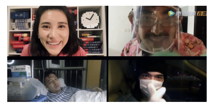
Figure 8 Screenshot of the online production of Waiting for Godot (2020), directed by Wang Chong.

conjecture and deception (101) about the true nature of the anticipated future, be it the arrival of Godot or the threat of viral death. In this light, Godot contemplates postpandemic futurity while also intimating a latent 'collapse or exhaustion' of the future, where the hope afforded by Popular Mechanics ' evocation of Three Sisters 'may turn to apathy, frustrated planning to disillusion, and imagination to fatigue' (19). Earlier, I characterised this work as a refusal of utopia not only because the uncanny suggestion of a circular future fraught with endless waiting undermines the possibility of utopian endings, as the couple are stuck in an eternal present that ends as it began – only with greater despair. Unless, of course, the elusive Godot finally appears and the postpandemic 'normal' he represents finally arrives. But also because their resolve to remain in the present – to wait for Godot, the end of the pandemic, and a return to their former lives – precludes any utopian refuge.