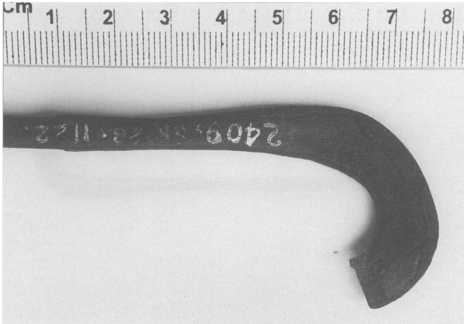
Figure 3: The same embryo knife or decapitator as in Figure 2, showing corrosion at the end of the blade.

The remedy then is to cut through the neck, in order that the two parts may be extracted separately. This is done with a hook, which resembles the one mentioned above, but has all its inner edge sharp. Then we must proceed to extract the head first, then the rest. 22