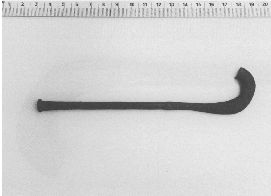
Figure 2: An embryo knife or a decapitator excavated at Taxila.

the Suśruta Saṃhitā , where a full chapter is devoted to the management of obstructed labour and surgical removal of the dead foetus.