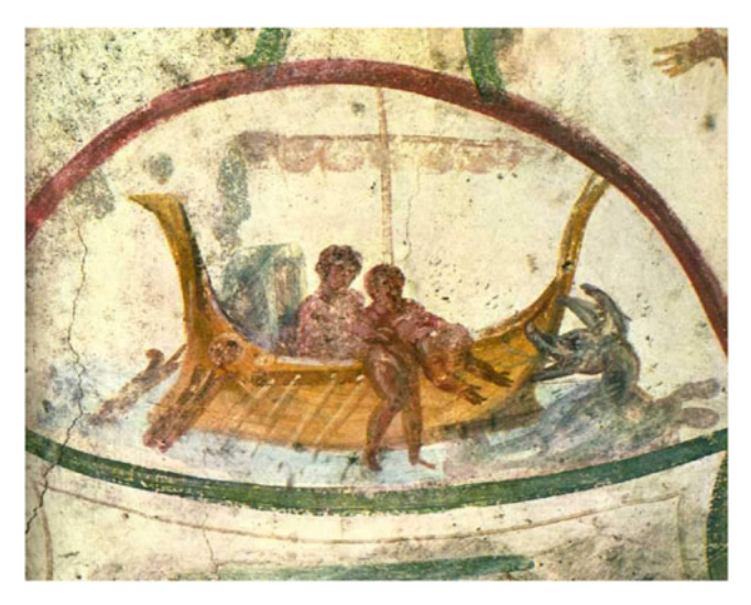
FIGURE 2. Wall Painting of Jonah in the Catacombs of Marcellinus and Peter (second century A.D.).

coastlines ( HN 9.70).<sup>21</sup> Similarly, the late antique Liber monstrorum mentions creatures in the Mediterranean Sea that are called 'caerulean hounds' ( caeruleos ... canes ),<sup>22</sup> a chromatic detail that aligns well with the sea-green colour of Jonah's \kappa\eta\tau\sigma\varsigma in the Catacombs of Marcellinus and Peter.