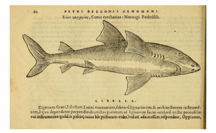
FIGURE 3. Drawing from Pierre Belon's De Aquatilibus (1553). Public Domain Image.

nor four legs that we commonly associate with dogs, but, to some, it might seem that there is a resemblance in terms of some underlying common nature with behavioural aspects. There is, for instance, the perception of wild dogs being carrion animals that may devour the unburied corpses of fallen soldiers at Troy ( Il. 22.42–5), a behaviour that is similarly attributed to fish when Eumaeus fears that Odysseus has been lost at sea and his lifeless body is ignominiously left to be devoured ( Od. 14.133–6). The common underlying nature between dogs and animals considered to be sea dogs is also explicitly addressed in the unexpected location of the Galenic corpus. In a discussion about why all diseases are called diseases, regardless of their varying effects, Galen raises the example of this shared nomenclature of terrestrial dogs and sea dogs. He states simply that, despite their many differences, they must be united by some underlying canine form (εἶδος), for which reason both called dogs ( Meth. Med. 2.128–30).