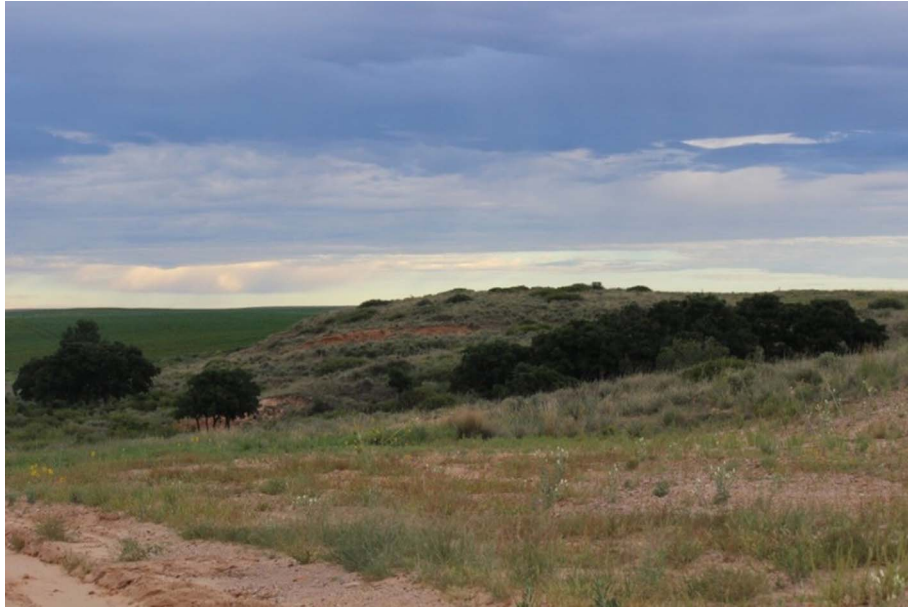
Figure 3. Looking south to Site #3: LARS North Site on east slope of hilltop.

to anyone who is not a professional archaeologist as an amateur or collector.