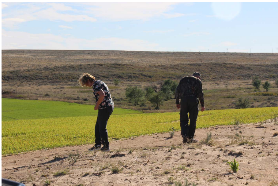
Figure 4. Author’s parents enjoying time collecting with their son (photograph by author).

Still others are motivated by the thought of finding a rare or unusual artifact. There is always that chance that one will expend a small amount of time and find something amazing, such as a perfect Clovis point.