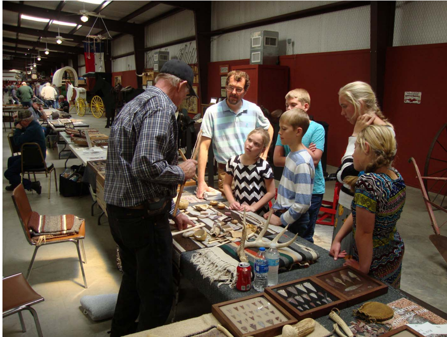
Figure 2. Perryton Stone Age Fair.