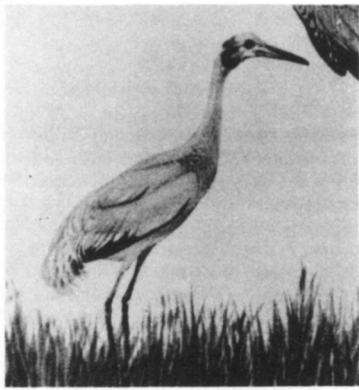
Brolga, the Australian crane