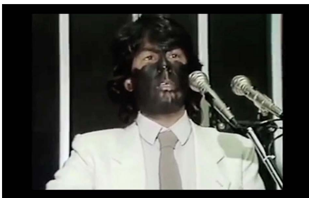
Figure 3. Scene 6: Calling. Krenak in the 1980s, his face painted black to personify mourning for indigenous peoples in front of parliament. Still frame from video recording used in Silence of the World.

Today we are the target of aggressions that, in essence, want to hurt our faith and our trust. Dignity still exists; it is still possible to build a society that knows how to respect the weakest ones, that knows how to respect those who have no money, but even so, there is an incessant defamation campaign going on. A people that has always lived without any wealth, that lives in houses covered with straw, and sleeps on mats on the ground, could never be by any means against Brazil’s