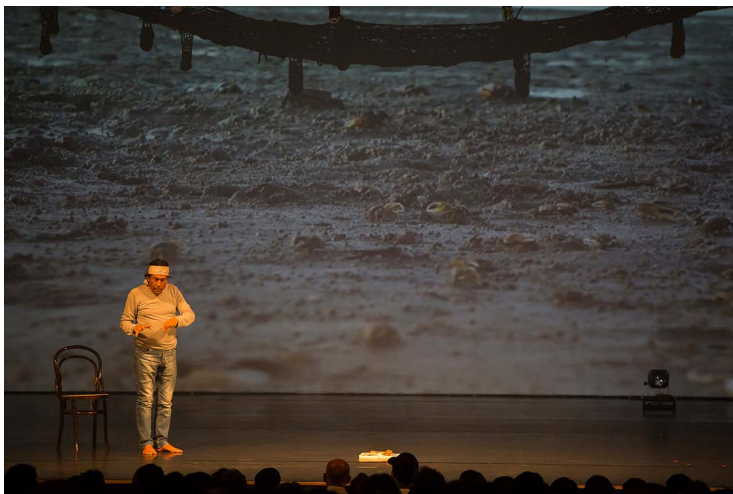
Figure 4. Scene 2: The Time of the Myth. Silence of the World at the 27th Porto Alegre em Cena, International Festival of Performing Arts.