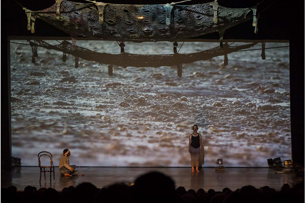
Figure 5. Scene 2: The Time of the Myth. Silence of the World at the 27th Porto Alegre em Cena, International Festival of Performing Arts.

undergo a long period of seclusion and attend to activities involved in the mourning of his people. Krenak and I decided to go to POA em Cena, but decided to invoke Kopenawa's presence by bringing to the scene fragments from our time with him. This is why we began the performance by reading to the audience a paragraph from the book The Falling Sky , in which Kopenawa shows the importance of his father-in-law in his formation as a shaman (Kopenawa and Albert 2013:256).