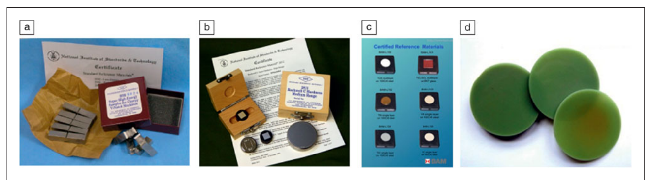
Figure 1. Reference materials, used to calibrate measurement instrumentation, come in many forms, from bulk metal artifacts to powders and films: (a,b) U.S. National Institute of Standards and Technology standard reference materials for calibrating (a) impact fracture<sup>3</sup> and (b) hardness<sup>4</sup> measurements. (c) Certified reference materials from Germany's Federal Institute for Materials Research and Testing (BAM)<sup>5</sup> for calibrating the depth resolution of surface chemical analysis techniques, consisting of both single-layer and multilayered coatings of metals and oxides. (d) Another reference material from BAM<sup>6</sup> for use in quality assurance, especially for measuring trace elements in polymers and related matrices.

To validate environmental claims about their products, polymer manufacturers need reliable measures of the biobased content in their feedstocks, which can also contain petroleum-based sources. The accepted measure of bio-based content is the level of <sup>14</sup>C isotope in the feedstock (basically, carbon dating), because ancient petroleum has lost its <sup>14</sup>C through radioactive decay whereas feedstocks derived from recently living organisms have a <sup>14</sup>C content related to the current equilibrium concentration in the atmosphere. ASTM has developed a protocol to quantify the bio-based content in materials by comparing the <sup>14</sup>C/<sup>12</sup>C ratio to that of a standard specimen typical of living organisms.<sup>10</sup>