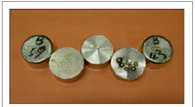
Figure 3. Disks of Standard Reference Material (SRM) 1728 Tin Alloy (Sn–3Cu–0.5Ag), a lead-free solder composition, showing various stages in manufacturing and testing. The alloy was created using a semi-chill casting process to ensure homogeneity of the disks to a depth of at least 10 mm. The SRM provides values for bulk composition of a number of elements, including chromium, cadmium, mercury, and lead, which are restricted in products around the world for environmental and health reasons.<sup>33</sup>

Driven by COST (European Cooperation in Science and Technology) Action 531<sup>35</sup> on lead-free solder materials, databases of solder thermodynamic and physical properties have been compiled. For example, the National Physical Laboratory (NPL), the UK's NMI, has established a public database of critically evaluated thermodynamic parameters for over 50 binary alloys and numerous ternary systems of eleven elements that can potentially be used in lead-free solder formulations.<sup>36</sup> The Polish Academy of Sciences compiled the downloadable SURDAT database,<sup>37</sup> which lists experimentally determined molar volumes, densities, and surface tensions of Ag–Cu and Sn–Ag–Cu systems. In addition, the Japanese Standards Association has established test methods for determining critical physical and engineering properties of lead-free solders (JIS Z 3198-1–JIS Z 3198-7).