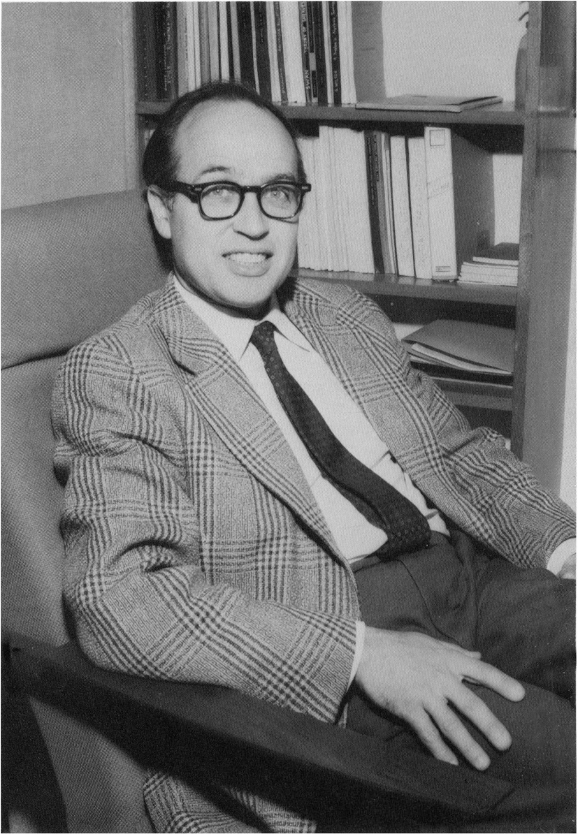
MICHAEL ATIYAH PRESIDENT 1981-82