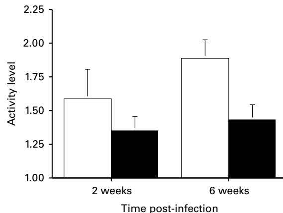
Fig. 1. Average activity level (mean \pm SE) for groups of control amphipods ( \square ) and amphipods infected by the trematode Maritrema novaezealandensis ( \blacksquare ), at 2 and 6 weeks post-infection. Values shown are the averages of 20 groups for each treatment. See text for method of measuring activity level.

When interpreting behavioural and other phenotypic changes in the host organism due to parasitic infection,