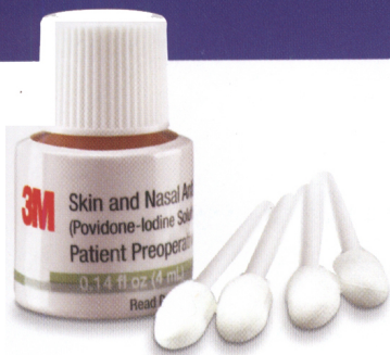
3M™ Skin and Nasal Antiseptic (Povidone-Iodine Solution 5% w/w [0.5% available iodine] USP) Patient Preoperative Skin Preparation

Meet Joe. He's heading into heart surgery and he's not always good at following the doctor's orders. Joe ate a few hours ago and forgot to use the shower product his doctor provided. He's got bacteria in his nares and his noncompliance is about to wreak havoc on your infection control measures.