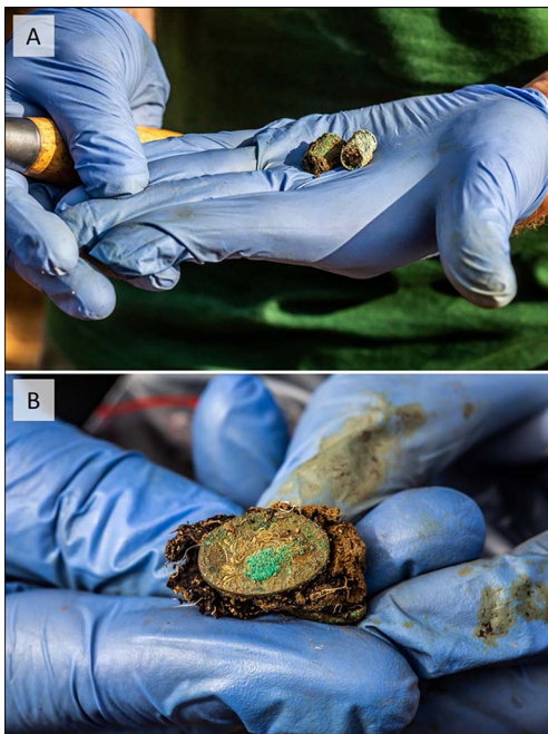
Figure 4. Material evidence of the crime in Death Valley. A) pistol casings; B) a gold-plated cufflink.

The second mass-execution site examined in 2023 was in the Szpegawski Forest, where a reported 2413–7000 human beings were taken and murdered by the Germans between September 1939 and January 1940. That mass execution also targeted members of the local intelligentsia, the mentally ill, general labourers and farmers, among others (Kobińska et al. 2024).