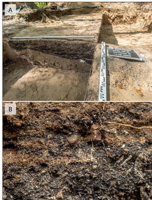
Figure 5. Mass grave in the Szpegawski Forest: A) excavating the grave; B) close-up of the layer consisting of burned human remains, artefacts and charcoal (photographs by D. Frymark).