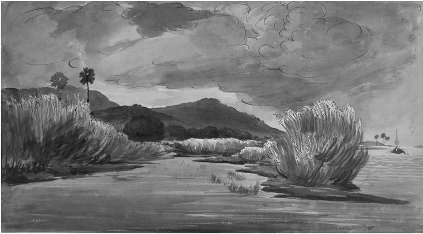
Figure 3. Henry Salt, “Ganges. Where Boatmen were nearly drowned”.

http://www.bl.uk/onlinegallery/onlineex/apac/other/largeimage65774.html ; © The British Library Board, WD 104. Used with permission.