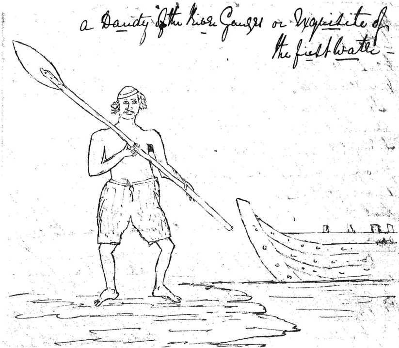
Figure 2. A dandy working on the river Ganges.

Francis James Hawkins, Diaries and Letters , Mss. Eur. B 365/4 ff. 2.