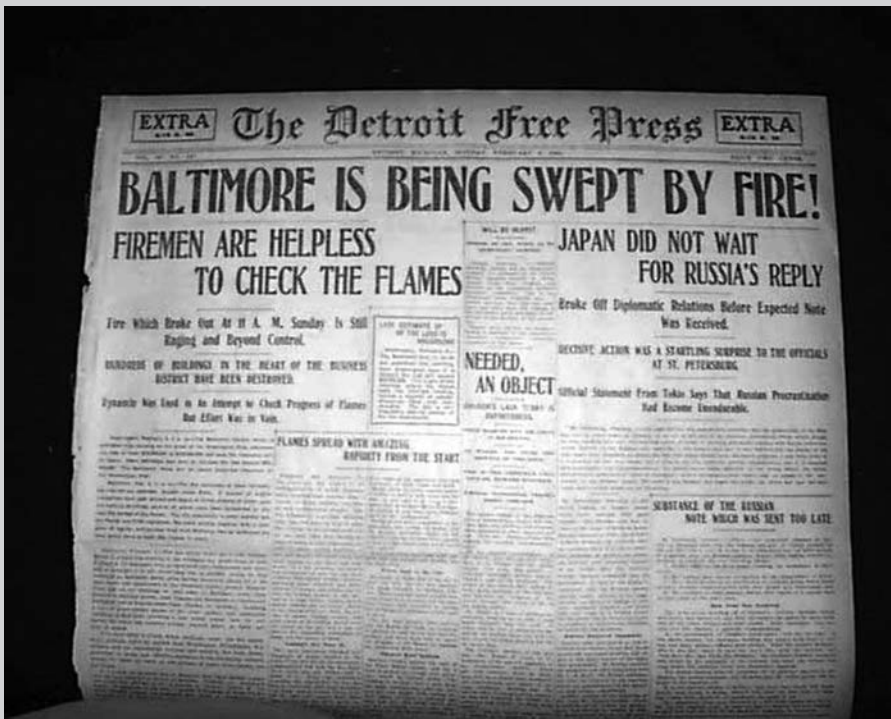
FIGURE 20.1 A lack of standardized fire hydrant couplings resulted in a tragic loss of life and property in the 1904 Baltimore fire.