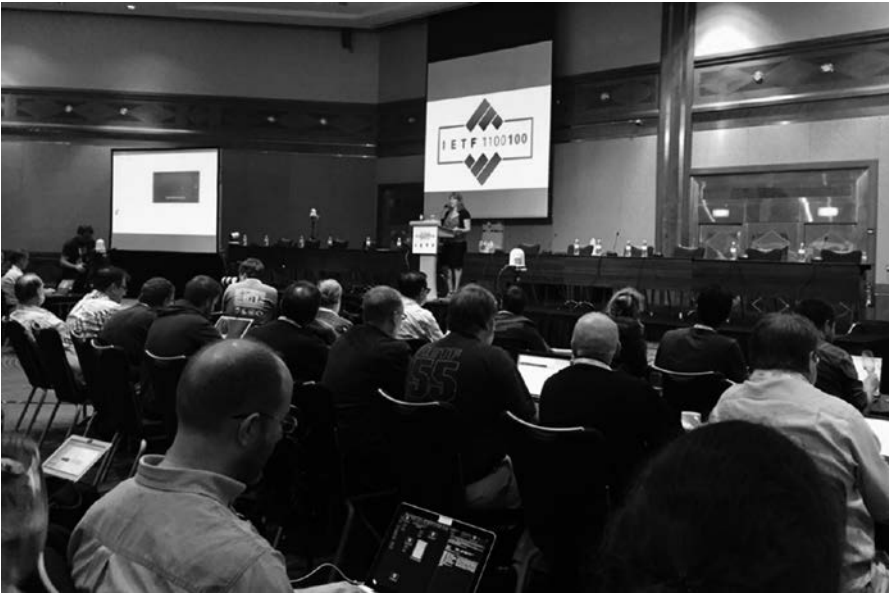
FIGURE 20.2 A 2017 meeting of the Internet Engineering Task Force (IETF).

contributions to the standard (SDOs themselves almost never obtain patent protection over their standards). However, to the extent that patents cover technologies that are “essential” to the implementation of a standard (“standards-essential patents” or “SEPs”), concerns can arise.