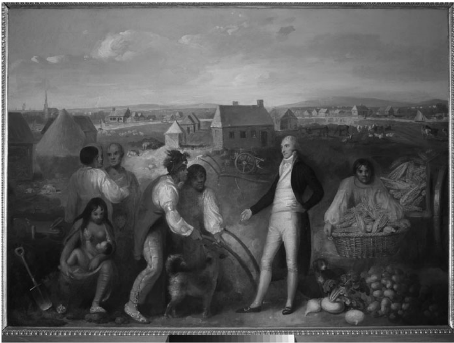
Figure 2. The Plan of Civilization , unknown artist, ca. 1800. The painting represents an idealized sense of the willing subordination of the Creeks, who were experienced cultivators, to the directives of people of European descent. Foods of the New World, depicted on the right, introduce a certain irony to the narrative taking place at the center of the painting. (Oil on canvas, 35 7/8 X 49 7/8 inches. Purchased by the Greenville County Museum of Art, South Carolina, with funds from the Museum Association's 1990 and 1991 Collectors Groups and the 1989, 1990, and 1991 Museum Antiques Shows, sponsored by Elliott, Davis & Company, CPAs.)

[that] shape and [in turn become] shaped by political, economic, and cultural forces[?]" In order to succeed in this new manner of inquiry, we would need to undo the process of inversion that has "othered" rural inhabitants and Indigenous peoples, as well as animals and plants—revising the "nature and I are two" position—and imagine a different array of simultaneous activities. What if the narrative of agricultural revolution had been interrupted by myriad alternative story lines? This is the act of "resuscitation" that the semiotic diamond is supposed to make possible. 15