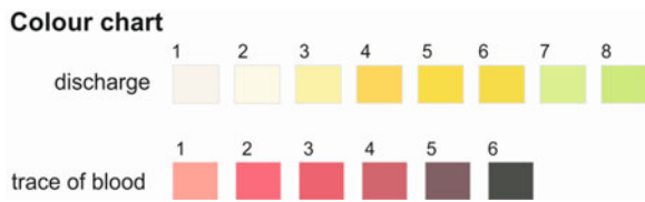
Fig. 1. Standardized symptomologies using a vaginal discharge colour chart (Hegertun et al. 2013) for visual comparisons.

(Hegertun et al. 2013). The colour chart exemplifies presence of blood or vaginal discharge. Environmental risk factors such as participants' day-to-day water contact activities putatively associated with urinary schistosomiasis and FGS were ascertained through more in-depth interviews. All discussions were made in local languages and simplified to the best understanding of the young female children (5–15 years).