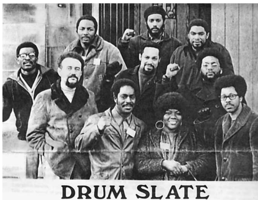
Figure 3. The DRUM candidates for the Detroit UAW Local 3 election in 1970 pose for a collective picture. As the raised fists and Afro hairstyles suggest, the group propounded a Marxist-Leninist ideology tinged with black nationalism.