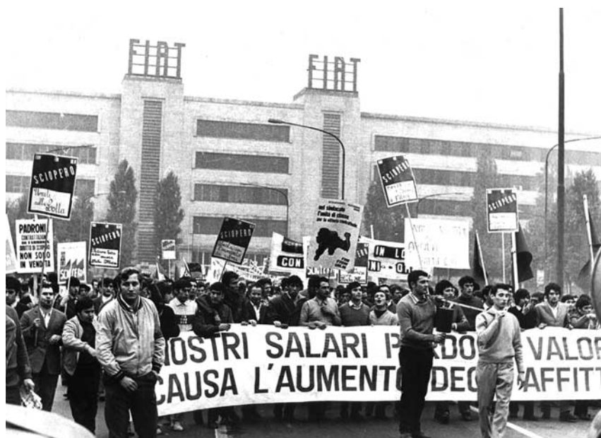
Figure 2. Car workers striking in front of FIAT's Mirafiori plant during the "Hot Autumn", a period of escalating workers' unrest. The photo conveys the boastful enthusiasm of the participants, very often young workers and southern immigrants.