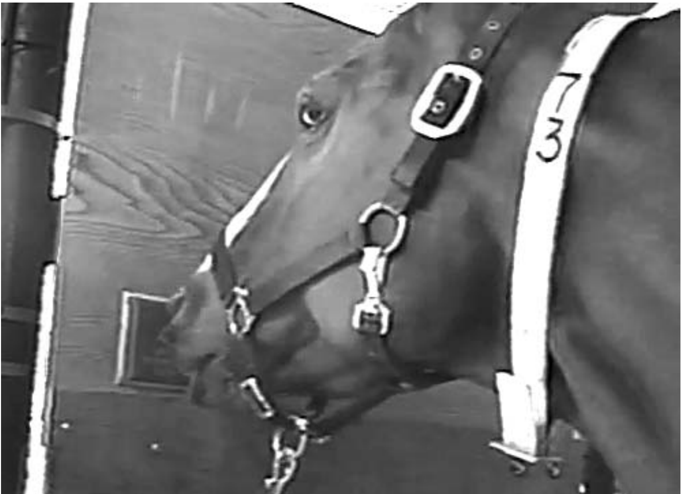
A horse performing the operant task. The horse is pushing a panel with its nose to release the upper door allowing access to a horizontal surface upon which cribbing can occur.

guished — the animal's motivation was too low to continue the test. Two methods were used to compare motivation for cribbing with that for food: the reservation method (highest amount of work performed for the reward) (Kirkden & Pajor 2006) and the slope of the demand for food and for cribbing (Matthews & Ladewig 1994).