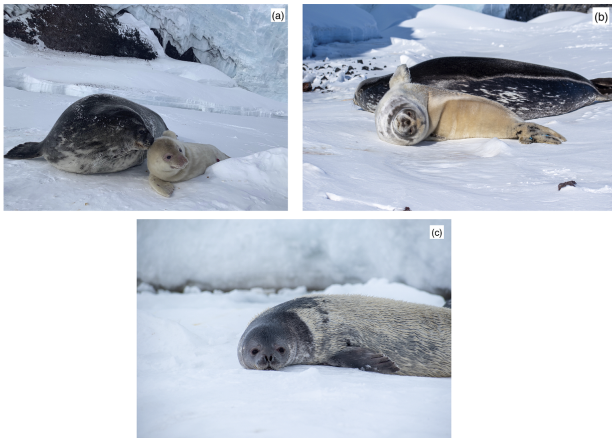
Figure 3. a. A leucistic female Weddell seal pup and her mother at the Hutton Cliffs colony in Erebus Bay, Antarctica. Note the light skin, lanugo, whiskers and nails. Photo credit: John Hobgood. b. Leucistic female pup on 18 November 2022 with her extremely light lanugo coat at ~3 weeks of age. Photo credit: Parker M. Levinson. c. Leucistic female at ~1 month of age on 27 November 2022, having shed her lanugo to reveal a darker-coloured coat. Note the pink eye rings and light whiskers. Photo credit: Parker M. Levinson.