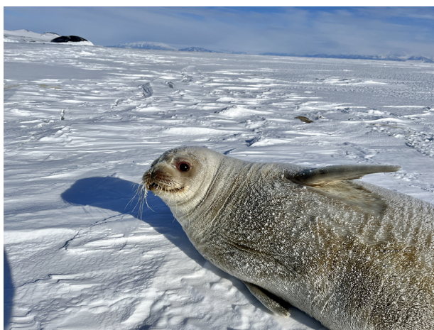
Figure 4. Leucistic yearling female near Turtle Rock on 23 October 2023. Note the pink eye rings, pale coat colour and white whiskers.

1 year, making it probable that this was not a result of diet. Additionally, no other seals in the vicinity or in the history of the study have been documented with this colouration, suggesting that the colouration was not a result of environmental causes. As such, we are reasonably confident that her light colouration is a result of a genetic mutation causing leucism, and, based on her pigmented eyes, it is improbable that she has albinism. More