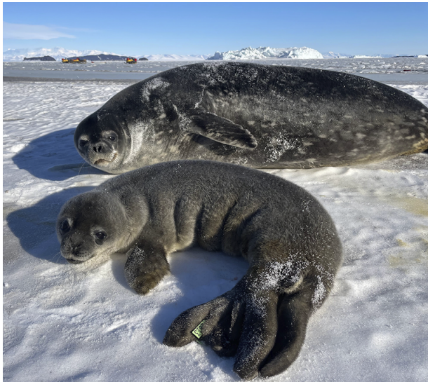
Figure 1. A pup with typical-coloured lanugo and its mother at rest on the ice.

(Fig. 1; Ray & Smith 1968, Thomas & Terhune 2009). Shedding their lanugo at ~6 weeks of age, pups transition to their adult coat, featuring shorter, more structured hair (Thomas & Terhune 2009).