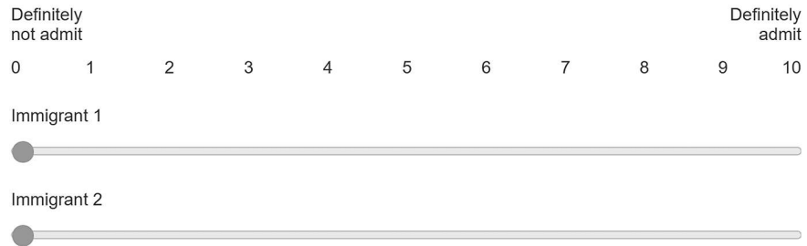
Figure 1. Experimental design.

On a scale from 0 to 10 where 0 indicates that the United States should definitely not admit the immigrant and 10 indicates that the United States should definitely admit the immigrant, how would you rate Immigrant 1 and Immigrant 2?