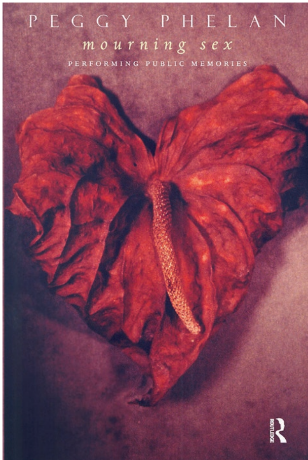
Figure 2. The cover of Peggy Phelan's Mourning Sex (1997), cover image photo by Peggy Phelan.

Maurice Blanchot. These experiments, along with other investigations of various writerly forms by many other scholar artists came to be called performative writing. But that is a story for another day. 1