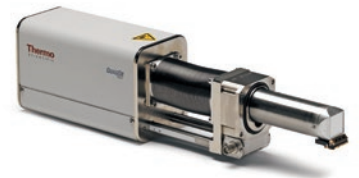
QuasOr EBSD Simultaneous EDS. Better data.