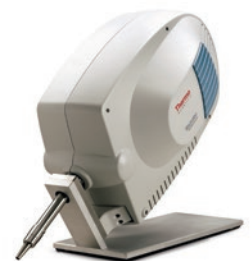
MagnaRay WDS Resolution with EDS Ease of Use