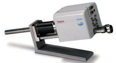
UltraDry EDS Detector Fastest Collection, Most Accuracy

• Discover more: thermoscientific.com/microanalysis