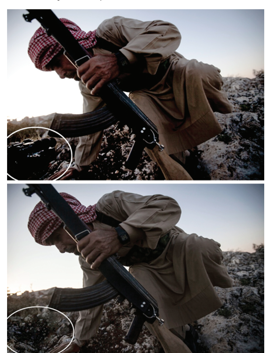
Figure 2. Image manipulation by Narciso Contreras

what the eye sees and get a larger dynamic range." To put it simply, it's the same file—developed over itself—the same thing you did with negatives when you scanned them.<sup>2</sup>