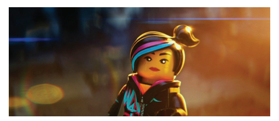
Figure 4. Wildstyle and lens flare in The Lego Movie

Now why would cgi artists working entirely on the computer add such artifacts, the very artifacts that many photographers seek to eliminate in postprocessing? The cgi medium borrows the flare effect, I suggest, because it has become so habitual a qualia of seeing film and films that its inclusion heightens the sense that viewers are watching a scene that was in turn seen through a lens by a cameraman. The inclusion of the evidence of mediation increases the realism and thus the propositional veracity of the image because it makes it look photographic rather than computer-graphic. We viewers are so habituated to filmic, which is to say glass-lens mediated, depiction that cgi filmmakers can help us to believe what we see as real by inserting lens effects that, when noticed at all, are seen as qualia of realism.