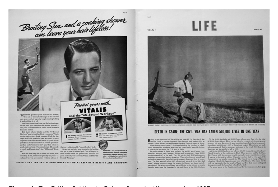
Figure 1. The Falling Soldier, by Robert Capa, in Life magazine, 1937

It has been hailed as the greatest war photo ever, yet has been subject to a barrage of claims that it is a fake, and counterclaims that it is true. Amid the his-