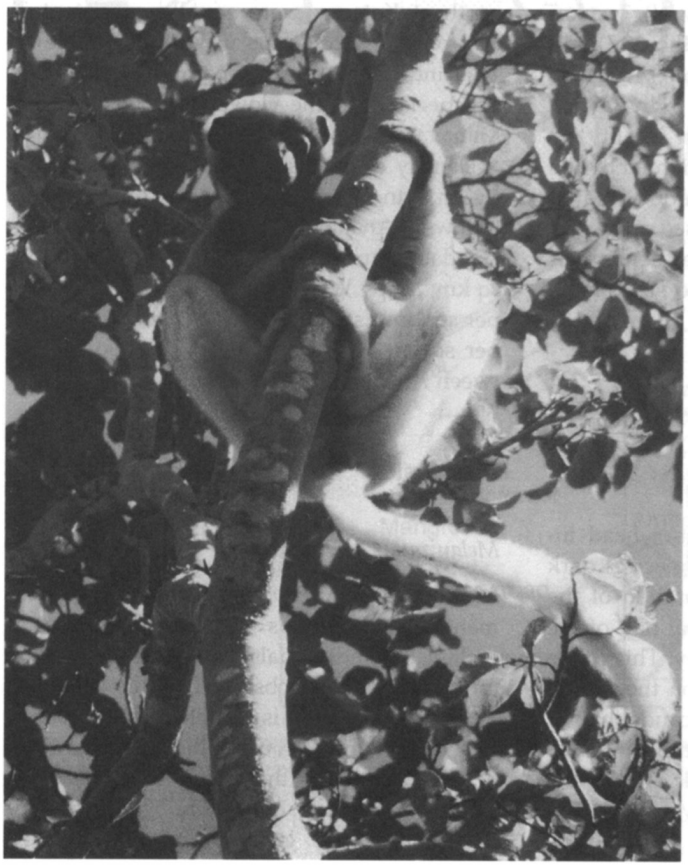
Figure 2c. P. v. deckeni, lighter melanistic form ( D. J. Curtis ).