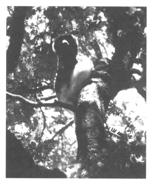
Figures 2a and 2b. P. v. deckeni, melanistic form (D. J. Curtis).