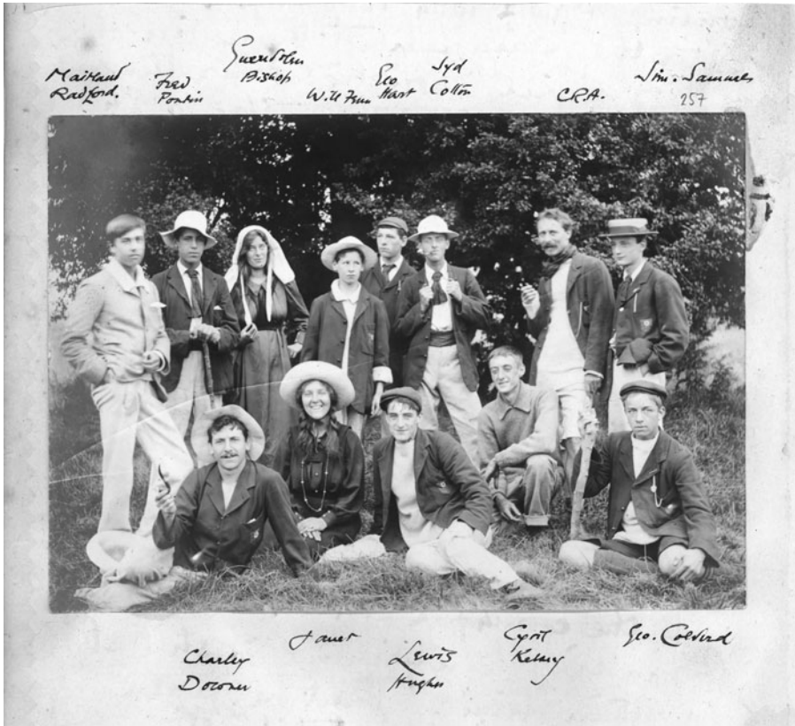
Figure 1. Guild of Handcraft River Expedition 1901: Bishop is standing third from left.