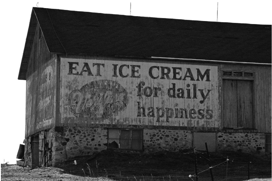
FIGURE 1.2 Ice cream advertisement on a barn in Plymouth, WI.

One of my favorite local landmarks is an old barn on the outskirts of town with a faded painted advertisement with a simple and powerful message that I internalized at an early age, "Eat Ice Cream for Daily Happiness" (Figure 1.2). As I became a food researcher, I was fascinated by the incredibly confusing and contradictory