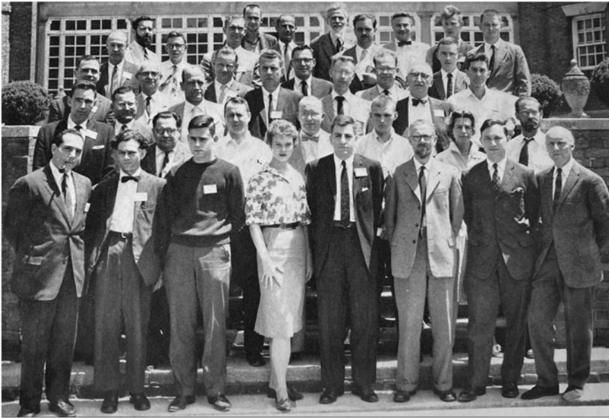
Fig. 1. The 1960 Symposium. Hayek, second from the right, third row from the top; Beer, fourth from the right, top row; von Foerster, first from the right, bottom row. In George Zopf, ed., The 1960 Symposium on the Principles of Self-Organization (London, 1961), ii.

Washington bear responsibility for deposing Allende and making the world over in the image of private capital, not the bordering-on-mystical properties that some economists impute to free markets. 6