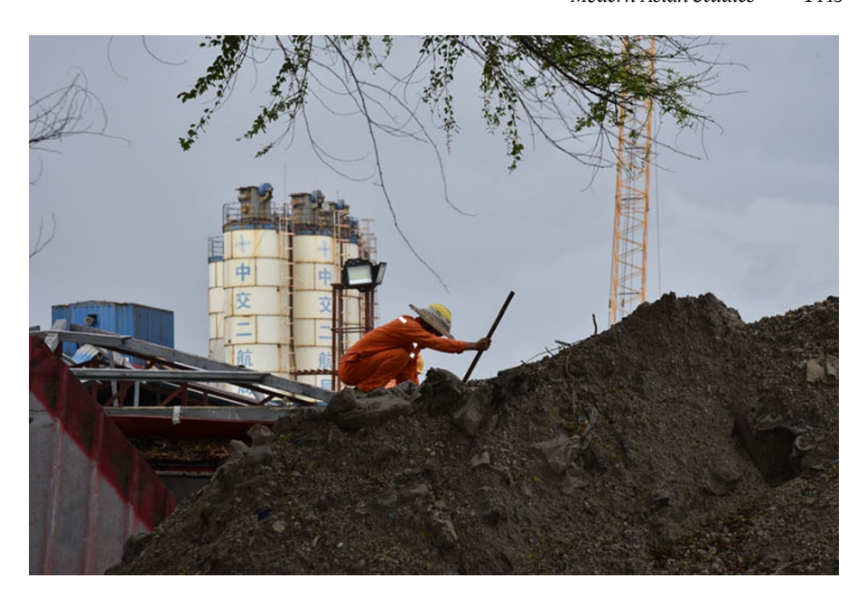
Figure 3. Chinese labourers working on bridge construction.

limited. As one local resident, Nadheem, commented, 'When the Bridge was being constructed, I could see them [Chinese labourers] grocery shopping near Dharubaaruge where their living accommodations were. I was very curious about them... we heard they were convicts being used as labourers as part of paying off their sentence...'. <sup>53</sup> The Chinese labourers were housed in designated barracks from which they were only permitted to leave for shopping and had to return promptly. While locals expressed their curiosity about the Chinese they saw out while running their errands, few seem to have made any effort to initiate conversations during these brief encounters (see Figure 3). Aside from the engineers and government officials who engaged directly with the Chinese, interpersonal interactions between Maldivian Muslims and these outside 'others' were extremely limited. <sup>54</sup>