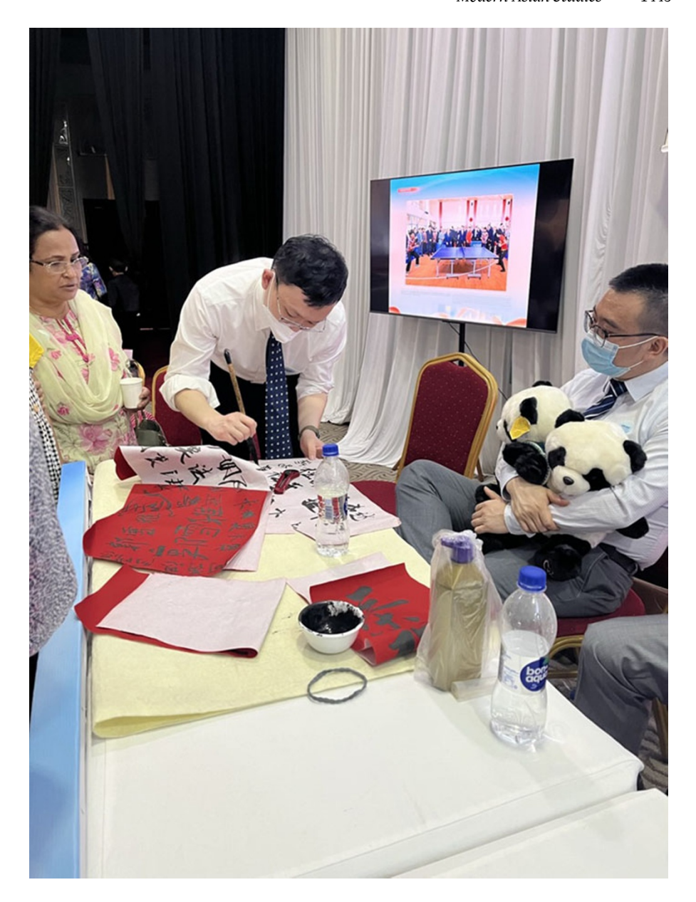
\textbf{Figure 4.} \ \ \textbf{A} \ \ \textbf{Chinese cultural event held in Male'}.

different from that of 'eliciting awe and reverence' in the way that Gergan^{58} has described for other contexts. Stories such as those of taxi drivers who reported