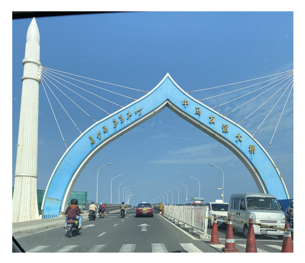
Figure 1. Inauguration of the China-Maldives Friendship Bridge.

...this bridge represents a starting point for China-Maldives relationships...so as to achieve common prosperity...as President Xi Jinping...respect, equals, amity, win-win cooperation...respect Maldives independence, sovereignty and territorial integrity...and we firmly support the development path independently chosen by the Maldivian people in line with its condition...China will continue to carry out cooperation...our bilateral cooperation should focus on the people so that...no matter how the ship may change...<sup>4</sup>