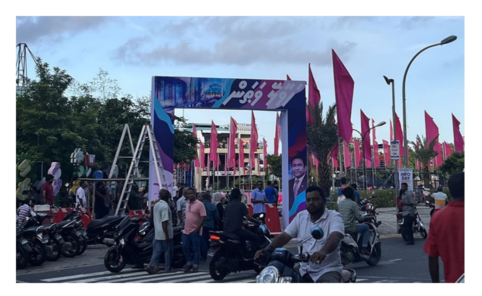
Figure 5. Members gathered at a PPM-PNC jalsaa in Male'.

something that deserves careful further consideration in attempts to understand the dynamics of religious transformation in Muslim countries involved with China's BRI.