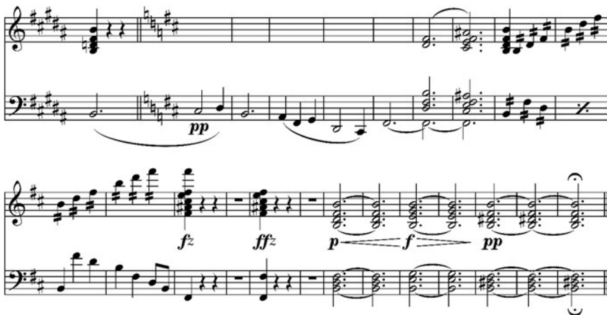
Ex. 5 A reproduction of Schubert's original sketch for the 'Unfinished' Symphony, mvnt i, coda

be heard as representing a virtual protagonist who is constantly haunted by the same ghostly presence in nightmares – that is, recurring nightmares. 33