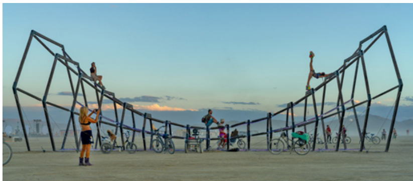
Figure 11 Re:Emergence (2022), Burning Man (Black Rock City, Nevada).