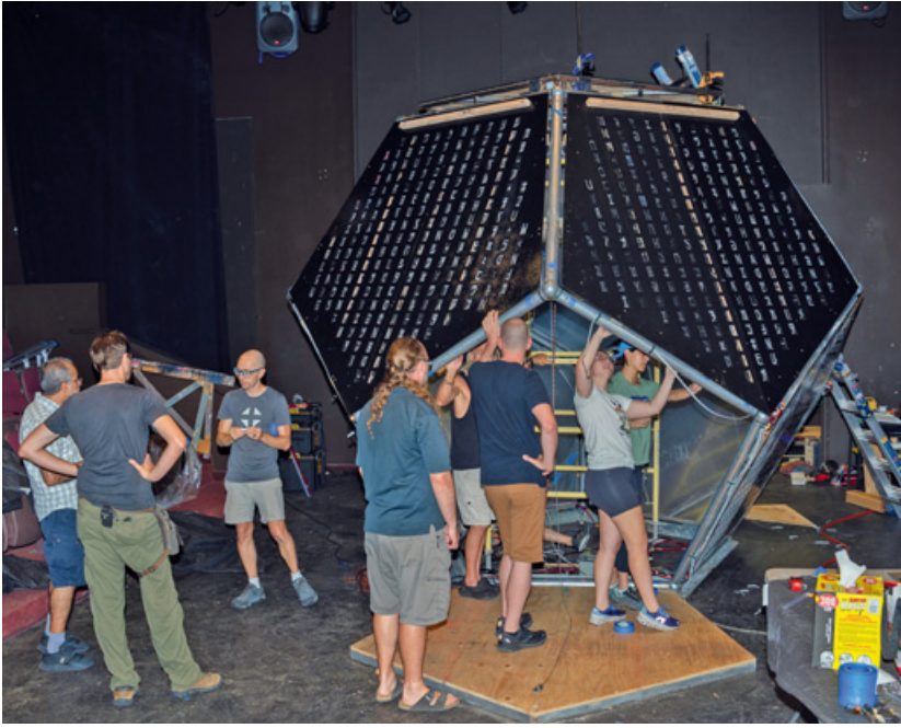
Figure 12 Unfolding Humanity (2023) Under Construction in USD's Studio Theater.